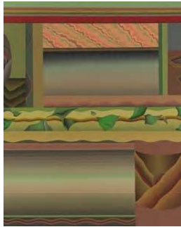
Title: Sound Raga (Spring) Date: 1977 Primary Maker: Evelyn Statsinger Medium: Oil on linen