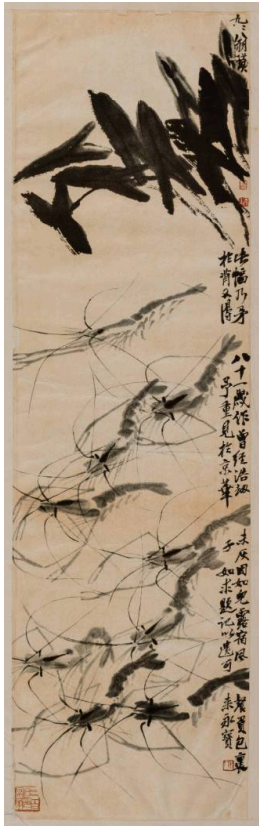
Title: Shrimp and Sagittaria Date: 1941 Primary Maker: Qi Baishi Medium: Ink on paper