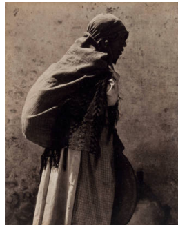
Title: Untitled [Woman, Ixmiquilpan, Mexico] Date: 1933 Primary Maker: Paul Strand Medium: Waxed platinum print