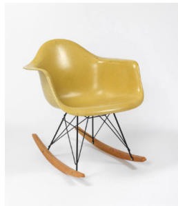
Title: Fiberglass Rocker Date: 1950 (design), 1975 (manufacture) Primary Maker: Charles Eames Medium: Molded (yellow) polyster reinforced with fiberglass, metal rod legs and wood rockers