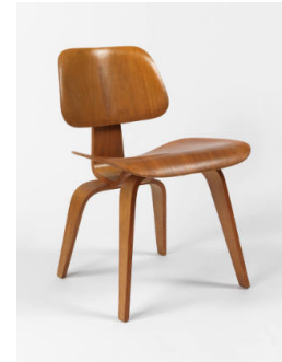
Title: Dining Chair Date: 1946 (design) Primary Maker: Charles Eames Medium: Molded and bent (birch?) plywood and rubber shockmounts