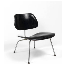
Title: Lounge Chair Date: 1946 Primary Maker: Charles Eames Medium: Painted and molded plywood with metal legs with rubber shockmounts