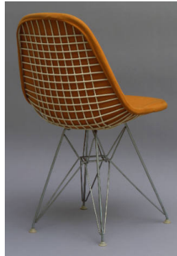
Title: Side Chair Date: 1951 Primary Maker: Charles Eames Medium: Formed enameled wire, wire legs and original (orange) upholstered seat cover