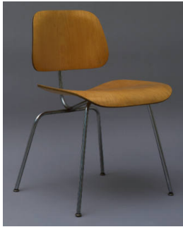
Title: Dining Chair Date: 1946 Primary Maker: Charles Eames Medium: Molded plywood, steel rods and rubber shockmounts