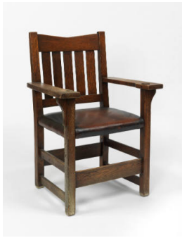
Title: Armchair Date: circa 1901 Primary Maker: Gustav Stickley Medium: Oak and original leather upholstered seat