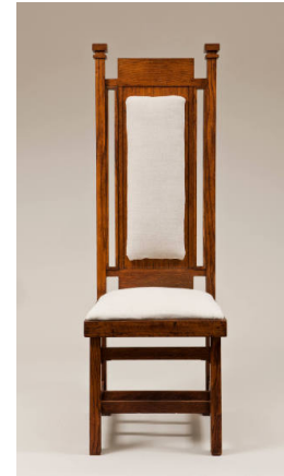
Title: Side Chair Date: circa 1909 Primary Maker: Frank Lloyd Wright Medium: Oak with (replacement) upholstered back and slip seat