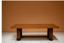
Title: Table top and base Date: circa 1909 Primary Maker: Frank Lloyd Wright Medium: Oak