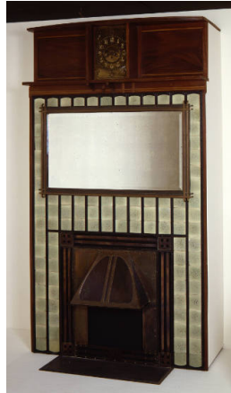
Title: Fireplace Surround Date: circa 1902 - 1905 Primary Maker: Gustave Serrurier-Bovy Medium: Brass, copper, wrought iron, mahogany, mirror and glazed porcelain tiles (Boch Frères, La Louvière, Belgium)