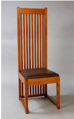
Title: Dining Table Side Chair Date: 1907 - 1910 Primary Maker: Frank Lloyd Wright Medium: Oak with (replacement) leather slip seat