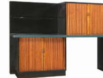
Title: Buffet Date: circa 1933 Primary Maker: Franz Singer Medium: Ebonized wood, painted walnut and fruit wood, painted wood, metal, and glass