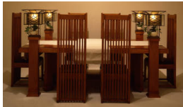
Title: Dining Table and Six Side Chairs Date: 1907 - 1910 Primary Maker: Frank Lloyd Wright Medium: Table: Oak, leaded colored and opaque glass, ceramic; Chairs: Oak with (replacement) leather slip seat