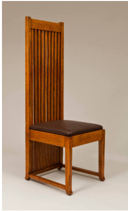
Title: Dining Room Chair Date: 1907 - 1910 Primary Maker: Frank Lloyd Wright Medium: Oak, replacement leather slip seat