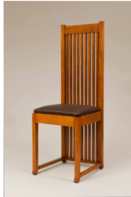
Title: Dining Table Side Chair for a Child Date: 1907 - 1910 Primary Maker: Frank Lloyd Wright Medium: Oak with (replacement) leather slip seat