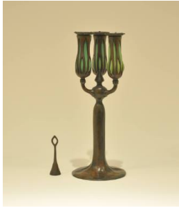
Title: Candlestick with Snuffer Date: circa 1900 Primary Maker: Tiffany Studios Medium: Medium patinated cast bronze with green glass