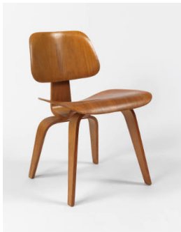
Title: Dining Chair Date: 1946 (design) Primary Maker: Charles Eames Medium: Molded and bent (birch?) plywood and rubber shockmounts