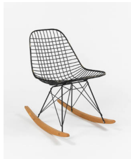
Title: Wire Shell Rocker Date: 1948 Primary Maker: Charles Eames Medium: Black enameled woven wire shell with wood rockers