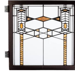
Title: West bedroom window for the Frederick C. Robie house [Robie window number 107]

Medium: Original wood casing with clear leaded glass and original metal hardware