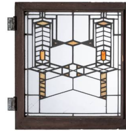
Title: Front entry hall window for the Frederick C. Robie house [Robie window number 33] Date: circa 1909 Primary Maker: Frank Lloyd Wright Medium: Original wood casing with clear and colored leaded glass and original metal hardware