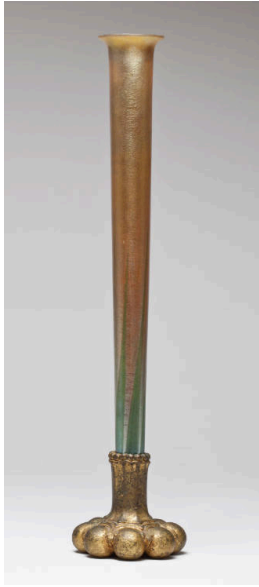
Title: Bud Vase with Base Date: n.d. Primary Maker: Tiffany Studios Medium: Gilt bronze and blown Favrile glass