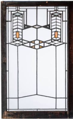
Title: Guest bedroom window for the Frederick C. Robie house [Robie window number 38]