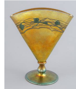
Title: "Aurene " Vase Date: circa 1918 Primary Maker: Steuben Glass Works Medium: Blown iridescent 'Aurene' glass with trailed decoration