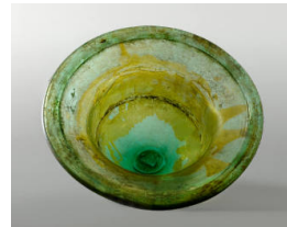
Title: Ancient Glass Bowl

Medium: Enameled and gilded blown green glass