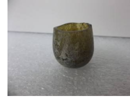
Title: Glass beaker Date: n.d. Medium: Green glass