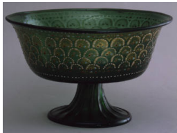
Title: Footed Bowl

Medium: Original wood casing with clear and colored leaded glass and original metal hardware