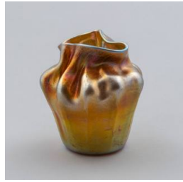
Title: Free-form Vase Date: circa 1906 - 1907 Primary Maker: Tiffany Studios Medium: Blown and crimped Favrile glass