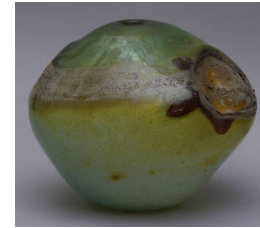
Title: Vase Date: n.d. Primary Maker: Kent Ipsen Medium: Free-blown glass