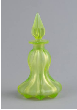
Title: Perfume Bottle with Stopper Date: n.d. Medium: Blown and cut opalescent green Uranium glass (Annagrün)