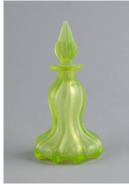
Title: Perfume Bottle with Stopper Date: n.d. Medium: Blown and cut opalescent green Uranium glass (Annagrün)