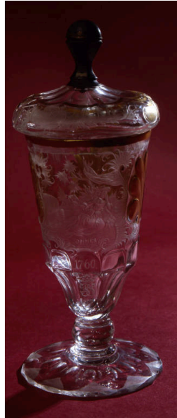
Title: Goblet with Lid (Pokal) Date: 1760 Primary Maker: Christian Gottfried Schneider Medium: Mold-blown, cut, engraved and partially gilded clear glass plus replacement brass finial