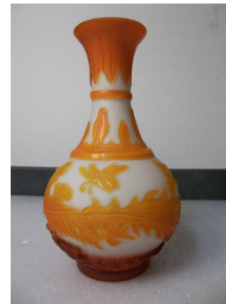
Title: Vase with Phoenix Decoration Date: probably mid to late 19th century Medium: Cased, cut glass of translucent ivory ground with orange overlay (Peking glass)