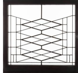
Title: Billiard room window for the Frederick C. Robie house [Robie window number 23]

Medium: Original wood casing with clear and colored leaded glass and original metal hardware