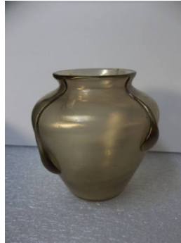
Title: Vase Date: circa 1900 Primary Maker: Unknown Artist Medium: Blown and applied iridescent colored glass