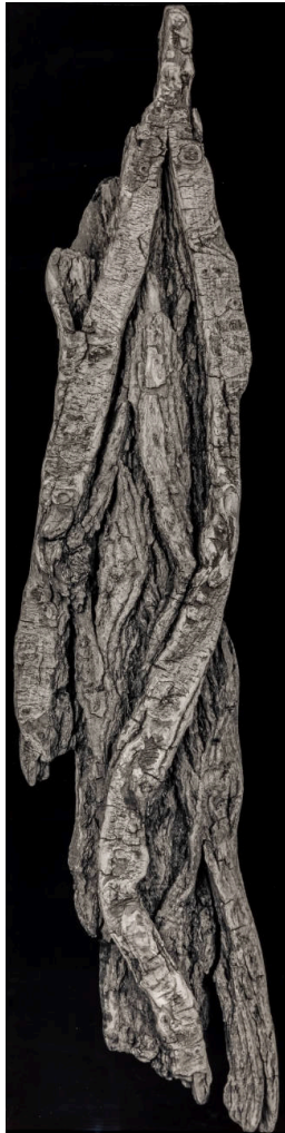
Title: From Coloma to Covert Sticks Date: 1990s Primary Maker: Barbara Crane Medium: Gelatin silver print