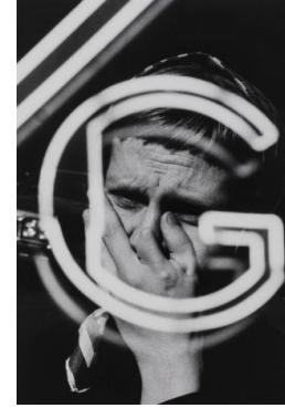
Title: Neon Series, Chicago Summer (Woman in 'G') Date: 1969 Primary Maker: Barbara Crane Medium: Gelatin silver print