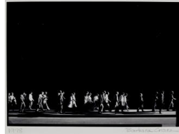
Title: Untitled Date: 1978 Primary Maker: Barbara Crane Medium: Gelatin silver print