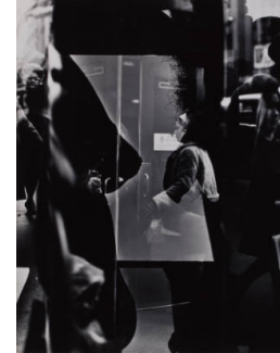
Title: Untitled (Walking) Date: 1969 Primary Maker: Barbara Crane Medium: Gelatin silver print