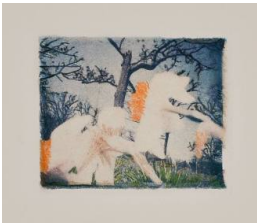
Title: Visions of Enarc II Date: 1988 Primary Maker: Barbara Crane Medium: Polacolor transfer with applied color