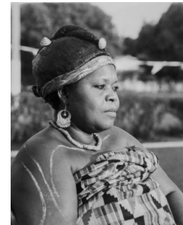
Title: A market woman, during a festival at the Ga Mantse's palace, Accra Date: circa 1970 Primary Maker: James Barnor Medium: Silver print, vintage print