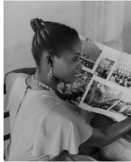
Title: Studio X23, Accra