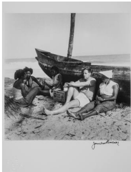
Title: Drum Party at Chorkor Beach, Accra Date: 1954 - 1956, printed 2017 Primary Maker: James Barnor Medium: Photograph