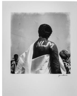
Title: National Liberation Movement Political Rally, Ghana, Kumasi Date: 1956, printed 2017 Primary Maker: James Barnor Medium: Enlarged silver print from original negative