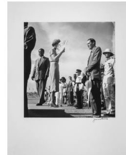
Title: Independence Celebrations, Duchess of Kent, Kwame Nkrumah, Accra Date: 1957, printed 2019 Medium: Enlarged silver print from original negative