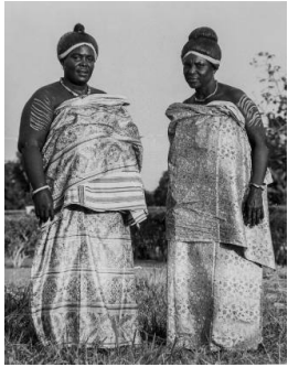
Title: During a festival at the Ga Mantse's palace, Accra