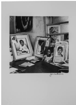
Title: Studio X23, Accra Date: circa 1974 - 1975, printed 2019 Primary Maker: James Barnor Medium: Enlarged silver print from original negative, controlled, numbered and signed by James Barnor